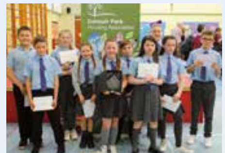
Sophie and Monthly Winners from Our Lady of Loretto

For all the glamour snaps from the awards evening please ensure you pick up a copy of our next magazine, due out in late September.